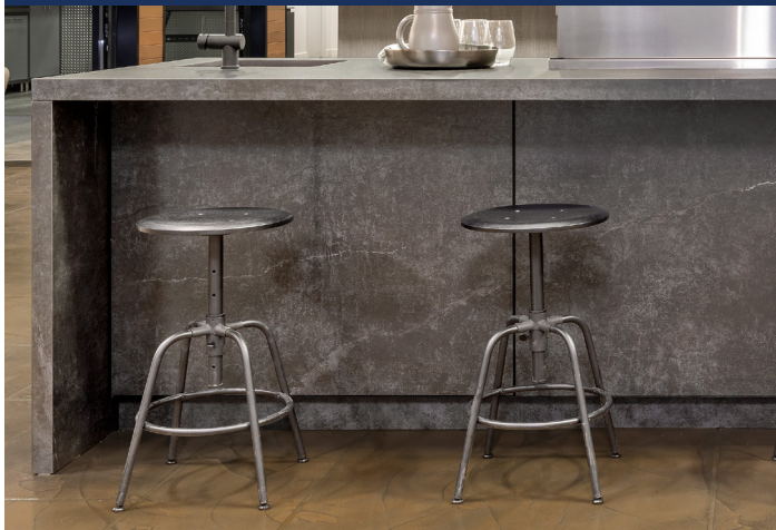
FINISH CONTINUES ON BACK SIDE